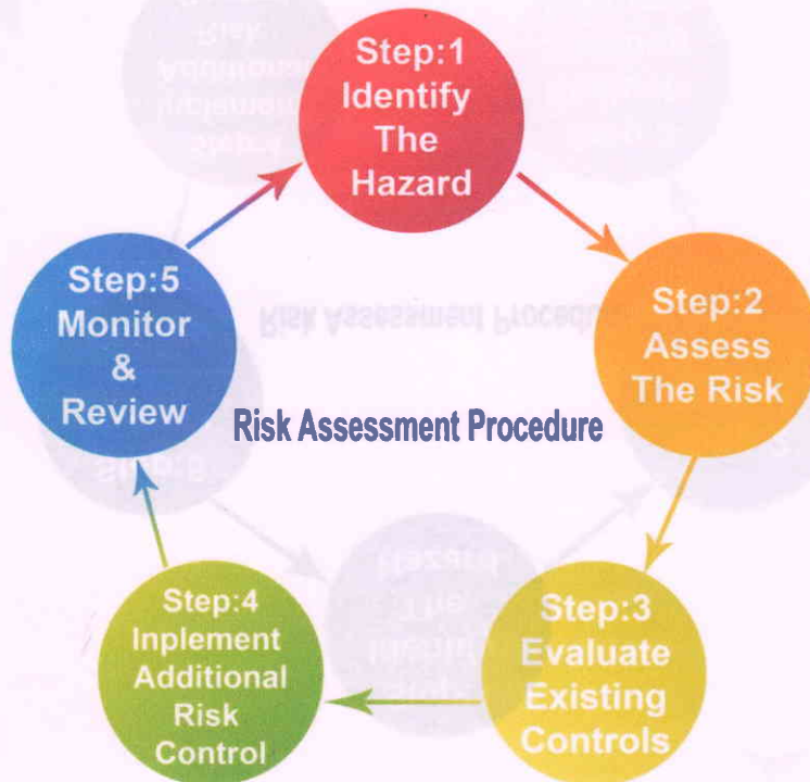
Figure - 1

Contact No: (0240)2556499, 2556799, 98500 56799, 74477 56799