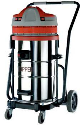
Topper 429/440 TNX