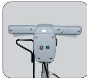
The handle is equipped with safety switches.