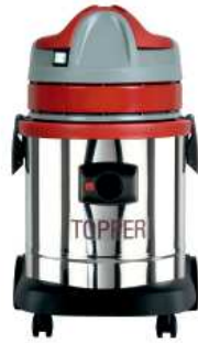
Topper 215/24L NX & HEPA