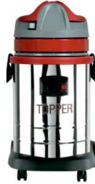
Topper 515 NX