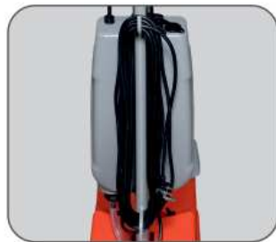
17 m of mains cable ensures a large operating radius.