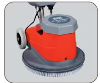
Easy brush change mechanism.