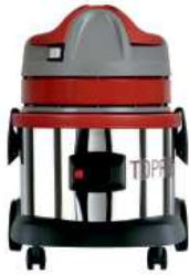
Topper 215 NX