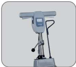
Adjustable handle to suit operator's of any height.