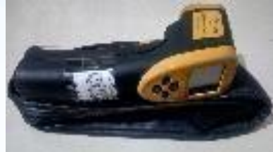
Digital Laser Temp Sensor