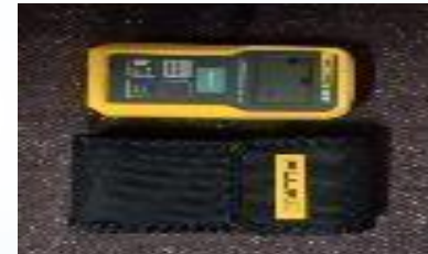
Laser Distance Meter

Calibrated and accurate Digital Earth Tester (MOTWANE) Make.