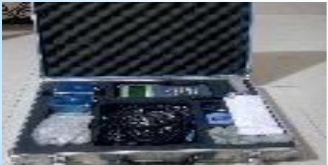
Ultrasonic Flow Meter