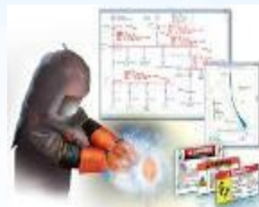
Arc Flash Analysis