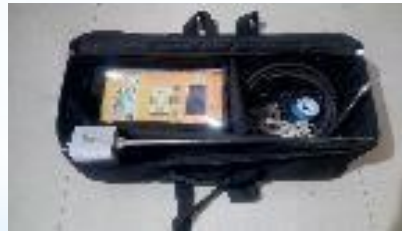
Portable Flue Gas Analyzer