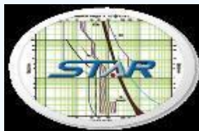
Protection Co-ordination Relay