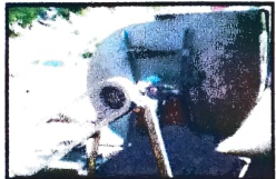
Fume Exhaust Blower