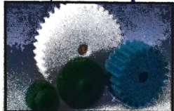
PP/Cast Nylon Gear