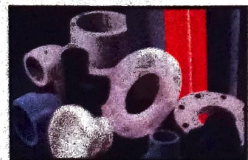
HDPE Pipe Fitting