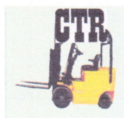
INDUSTRIAL PVC STRIP CURTAINS