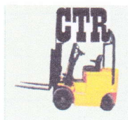
INDUSTRIAL PVC STRIP CURTAINS