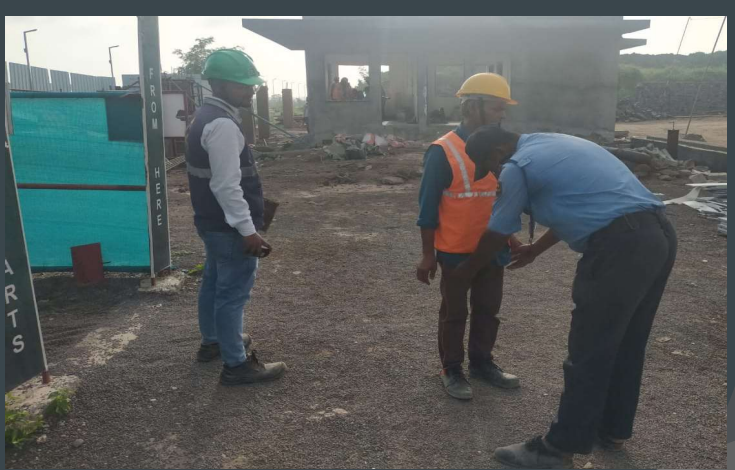
Daily Morning Alcohol Testing & Tobacco/Pan Masala checking by the Security Staff before start the TBT