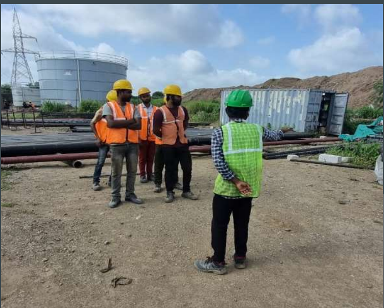
Daily On-Site Tool Box Talk conducted by the Concern Safety staff with Sub-Contractors workmen regarding work & activity