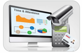
Time & Attendance