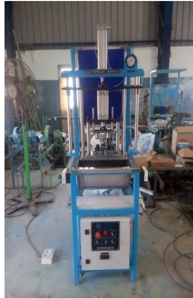
WATER LEAK TEST M/C