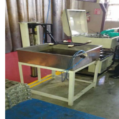
OILING M/C – GM