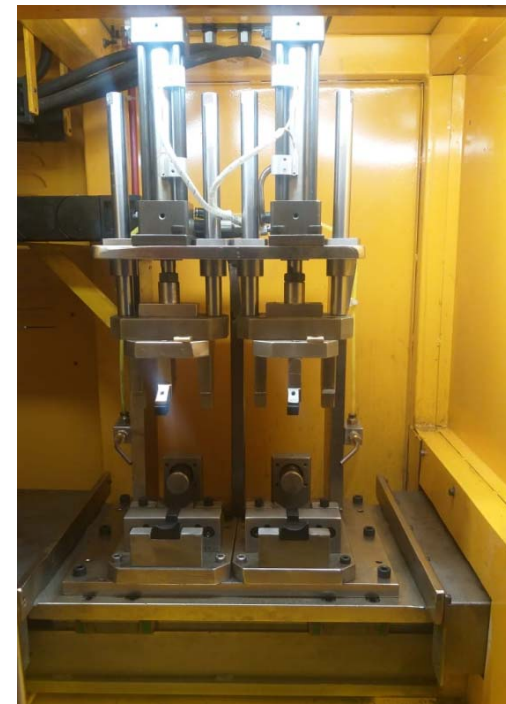
2 STATION RCM FIXTURE - BOSCH TMC BODY