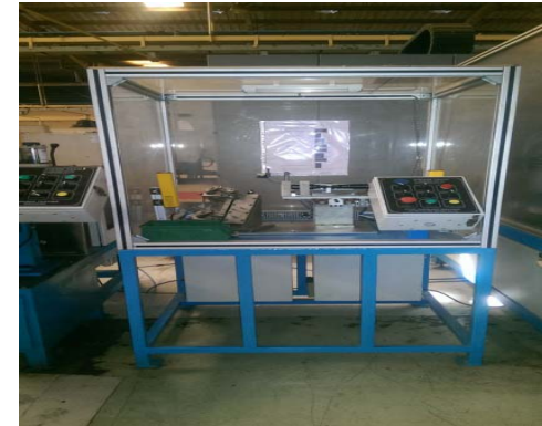
STUD TORQUING M/C