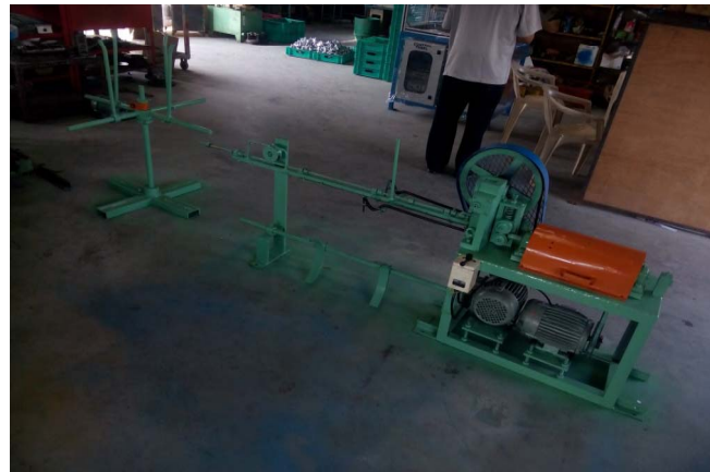
WIRE CUTTING CUM STRAIGHTENING M/C