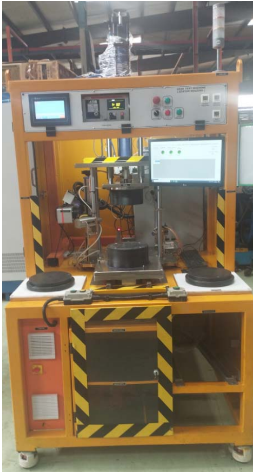
LEAK TEST M/C - STATOR HOUSING

Special Purpose Machines, Jigs & Fixtures, Low cost Automation Services