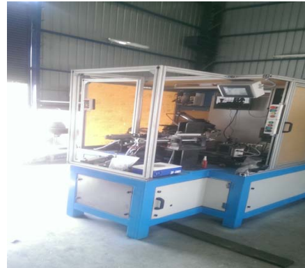
PIPE PRESS , TORQUIE, LEAK M/C