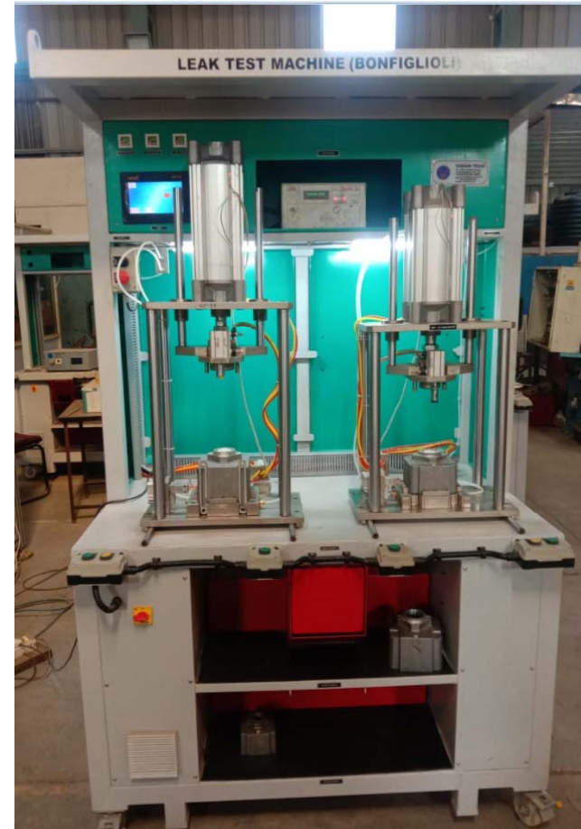
2 STATION LEAK TEST MACHINE - BONFIGLIOLI