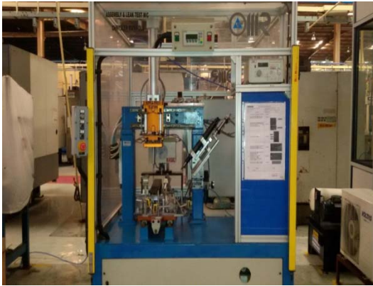
ASSLY CUM LEAK TEST M/C

Special Purpose Machines, Jigs & Fixtures, Low cost Automation Services