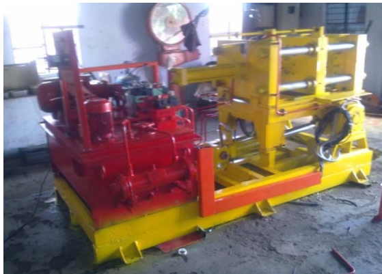
GRAVITY TILT DIE CASTING M/C