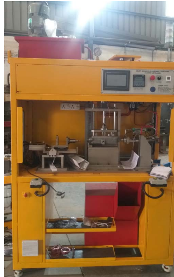
STUD TORQUING M/C – INLET MANIFOLD