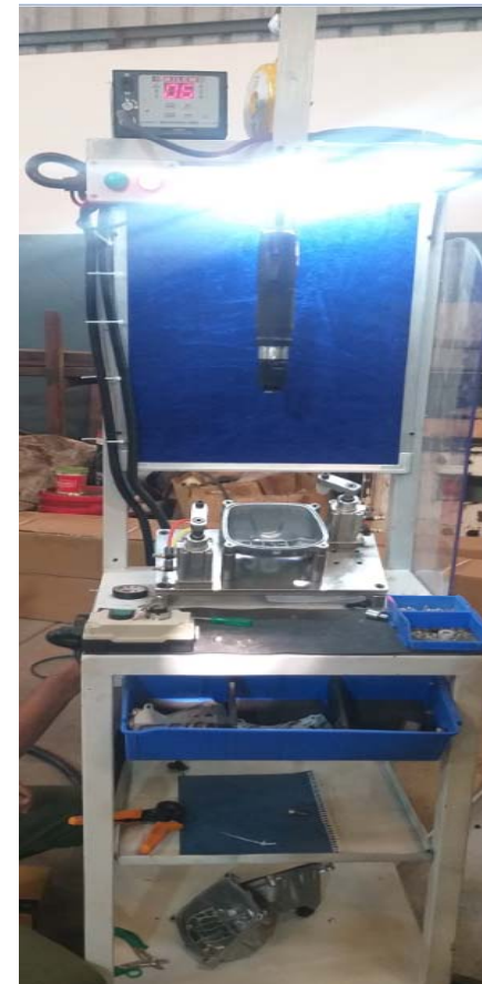
ASSEMBLY M/C- COVER CYLINDER HEAD