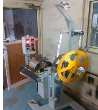
UN REELER M/C - DHOOT