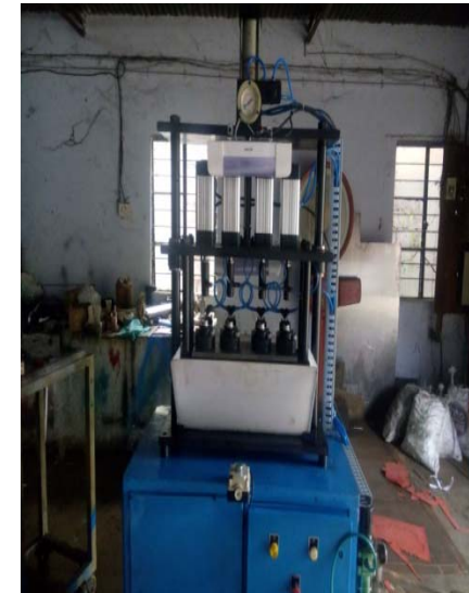
WATER LEAK TEST M/C