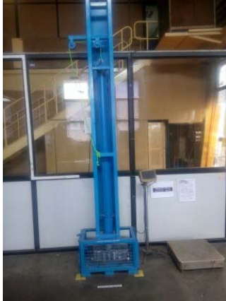
ENDURANCE TEST M/C – VW

Special Purpose Machines, Jigs & Fixtures, Low cost Automation Services