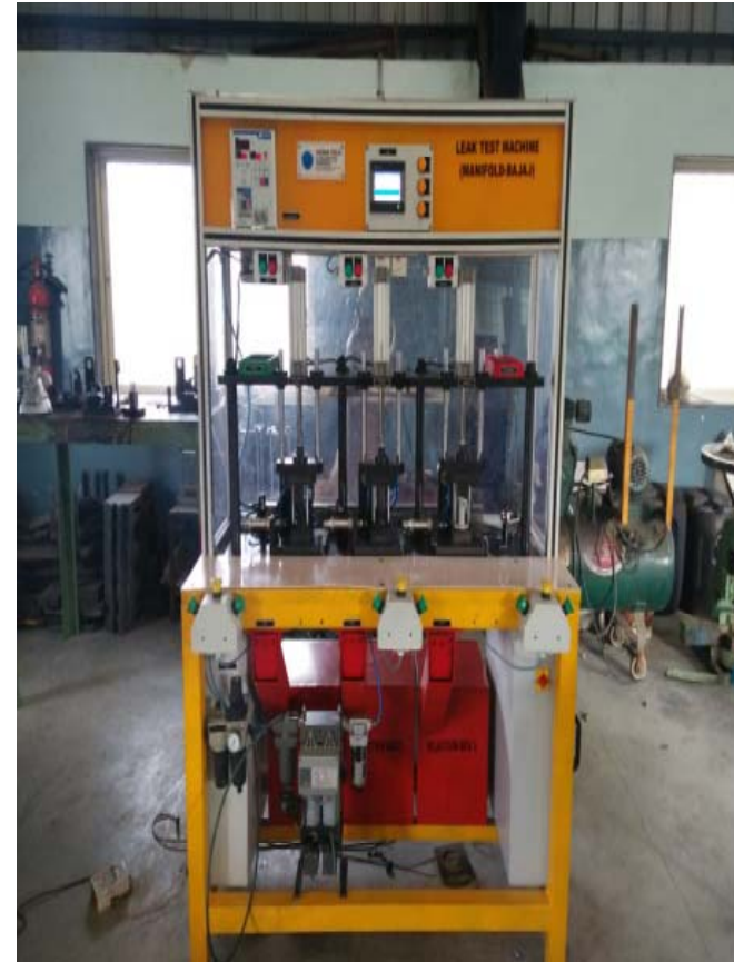
LEAK TEST M/C - BAJAJ MANIFOLD