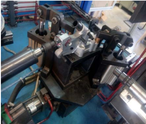
ADAPTER ASSLY M/C