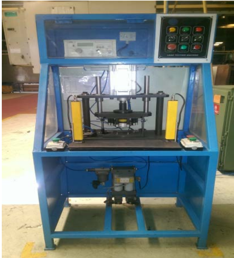
LEAK TEST M/C - R R OIL SEAL FORD

Special Purpose Machines, Jigs & Fixtures, Low cost Automation Services