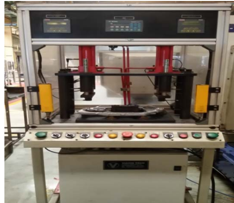
BUSH PRESS M/C