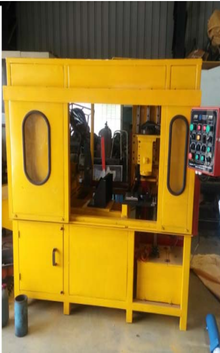
RISER CUTTING M/C – COMPRESSOR

Special Purpose Machines, Jigs & Fixtures, Low cost Automation Services