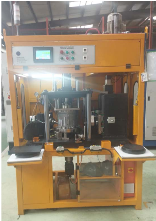
ASSEMBLY M/C - STATOR HOUSING

Special Purpose Machines, Jigs & Fixtures, Low cost Automation Services