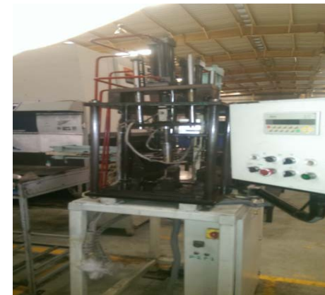
SLEEVE PRESS M/C