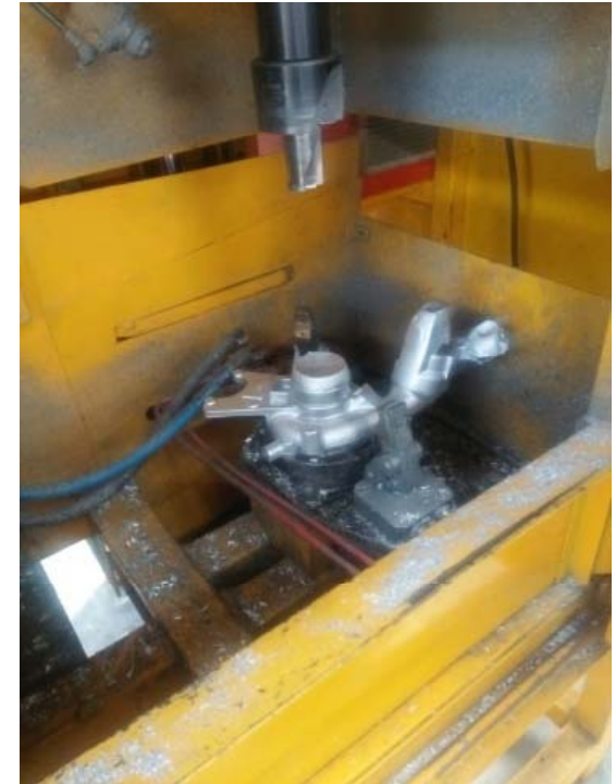
DRILL CUM SPOT FACE M/C