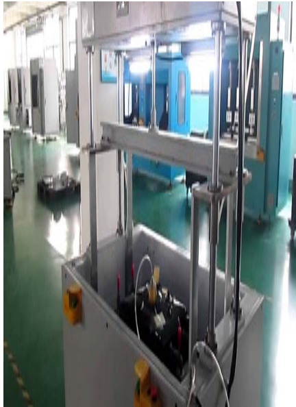
WATER LEAK TEST M/C

Special Purpose Machines, Jigs & Fixtures, Low cost Automation Services