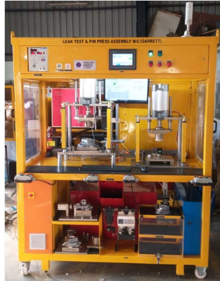
LEAK TEST AND PIN PRESS ASSEMBLY M/C- GARRETT