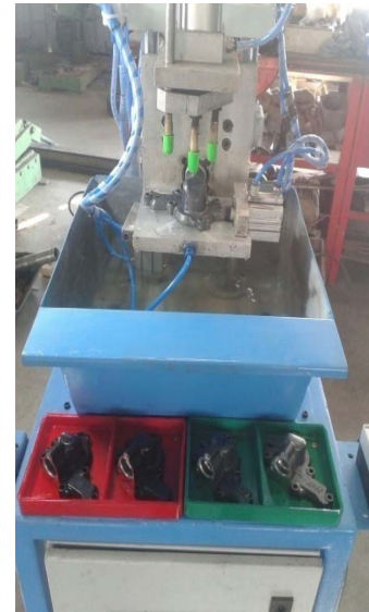
WATER LEAK TEST M/C