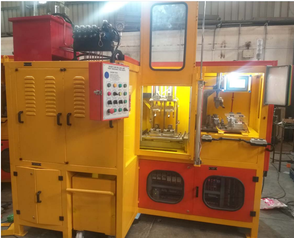
2 STATION RCM MACHINE – BOSCH TMC BODY

Special Purpose Machines, Jigs & Fixtures, Low cost Automation Services