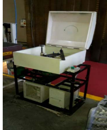
DE OLING M/C - GM