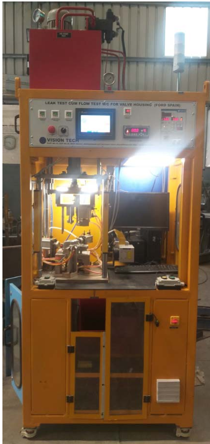
LEAK TEST CUM FLOW TST M/C - FORD VALVE HOUSING

Special Purpose Machines, Jigs & Fixtures, Low cost Automation Services