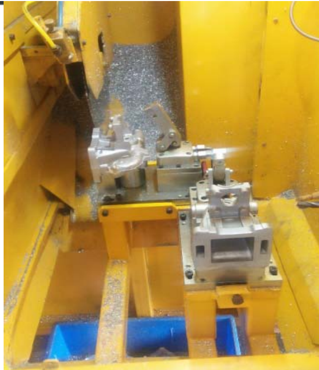
RISER CUTTING M/C – KSPG