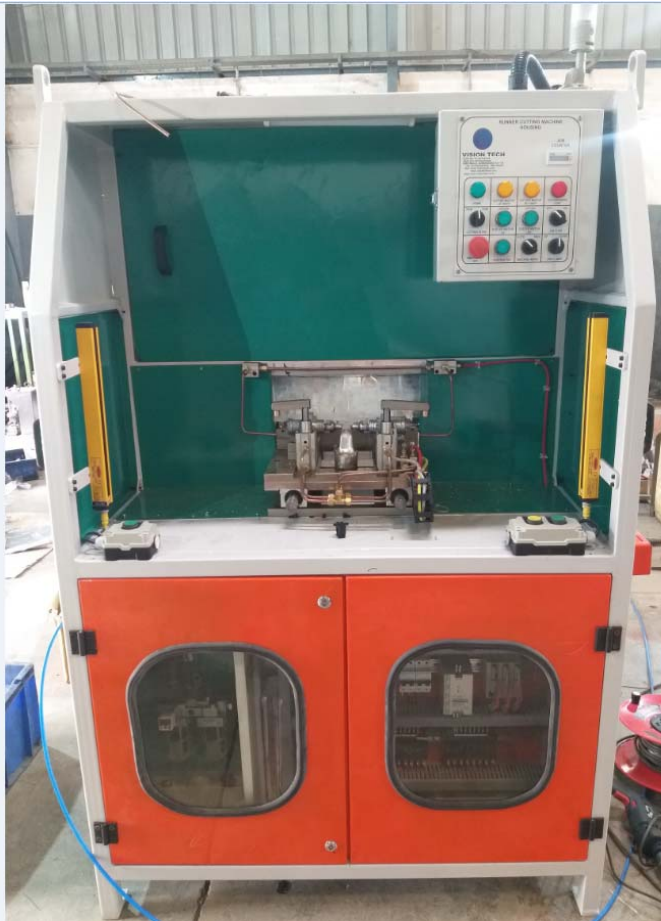
RCM MACHINE – THROTTLE BODY

Special Purpose Machines, Jigs & Fixtures, Low cost Automation Services