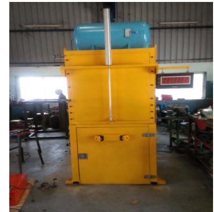
SAND DECORING M/C