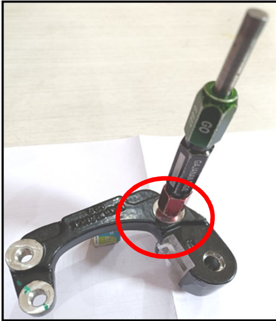
M8*1.25 tapping PPG nogo side passed.