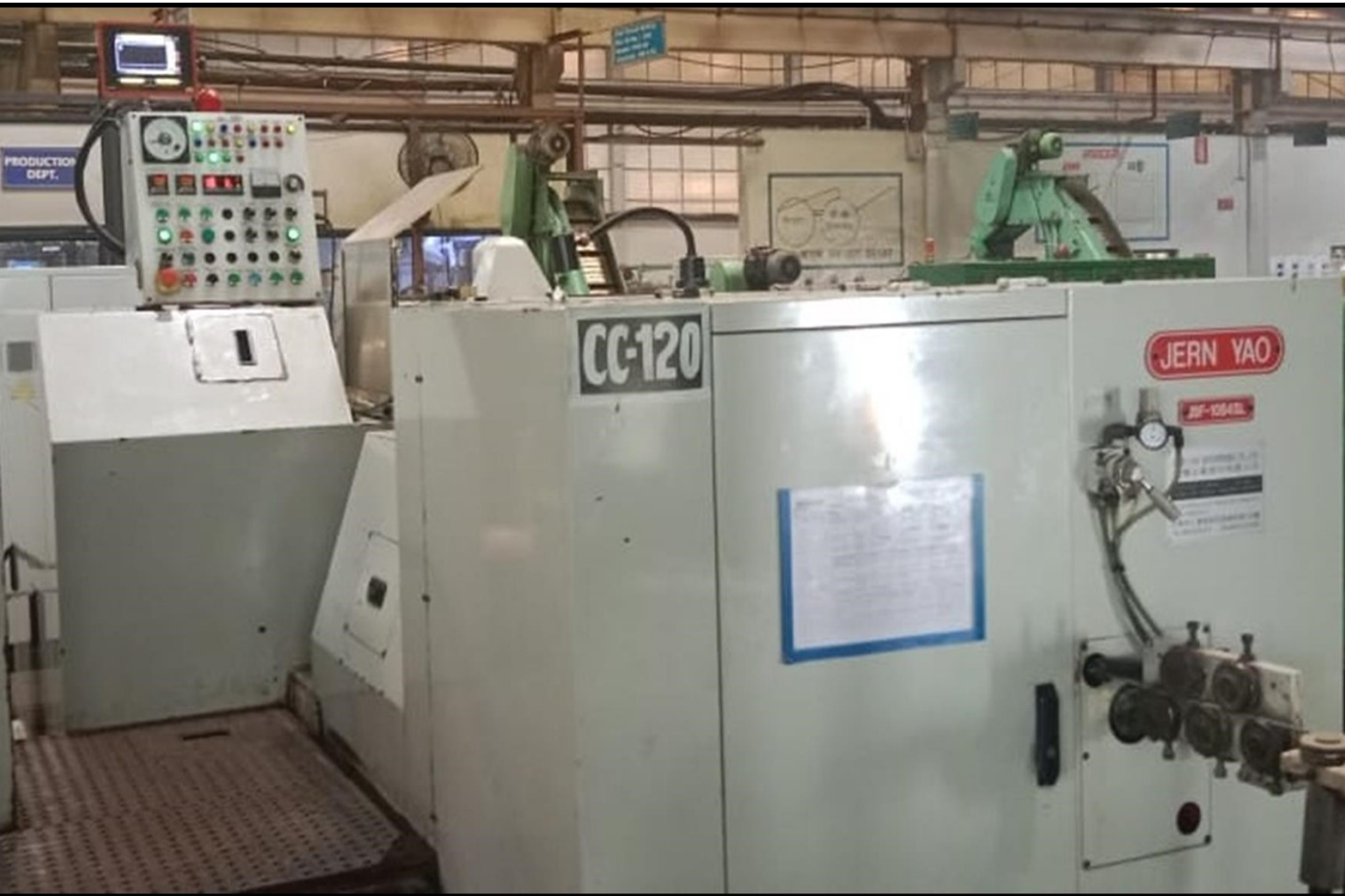
Machine installed with SK 400 Sensor