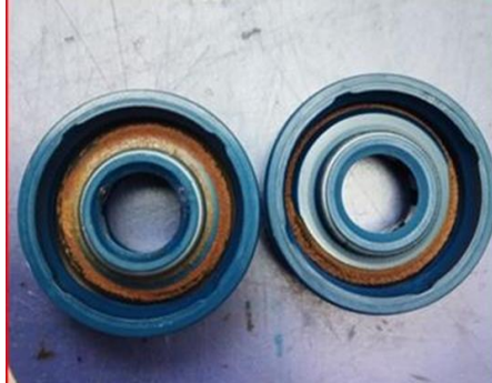
Rust on metal area