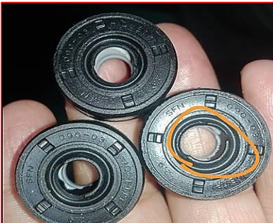
Cut @ Dust Lip Area Due to Dirty Cavity