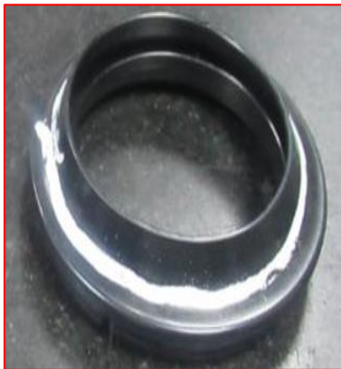
Top Side Dust Lip Deformed