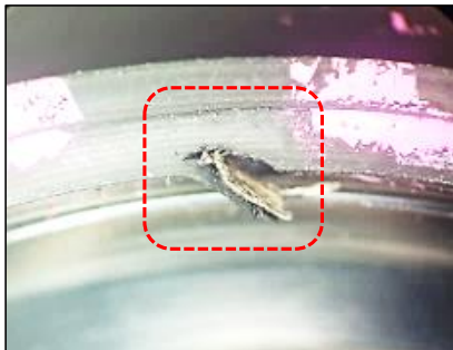
Cut @ Main Lip Edge