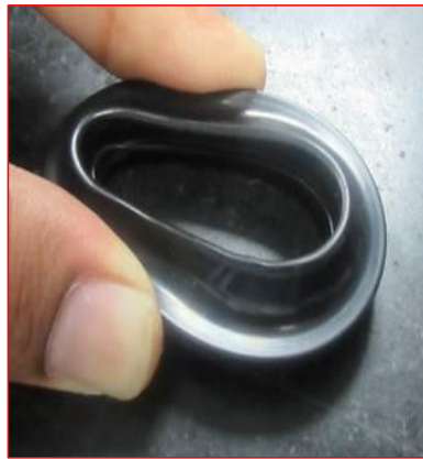
Dust Seal Without Metal Insert