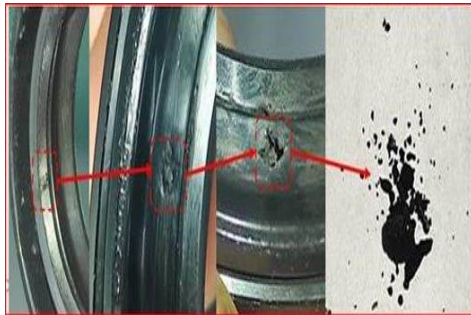
Contamination (Foreign object) @ Main Lip Edge