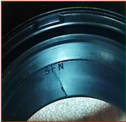
Tear at Lip area