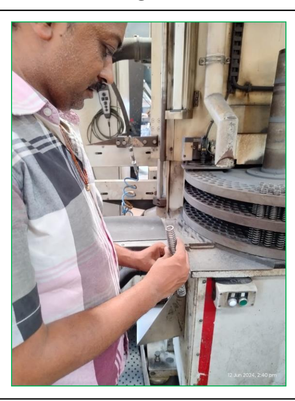
Impact: * Sampling Inspection at Grinding stage

Corrective Action: * 100% Visual Inspection at Grinding stage