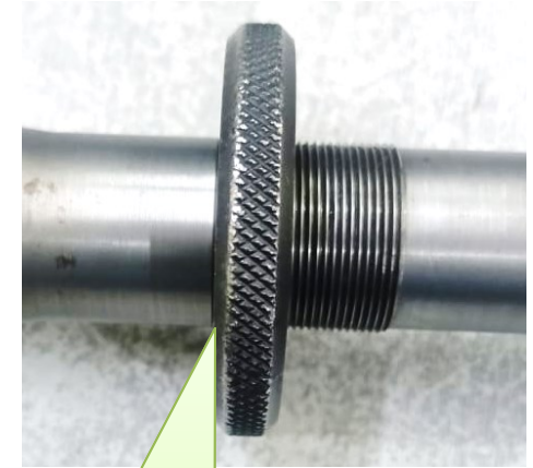
NO Gap ,gauge answering till groove end.