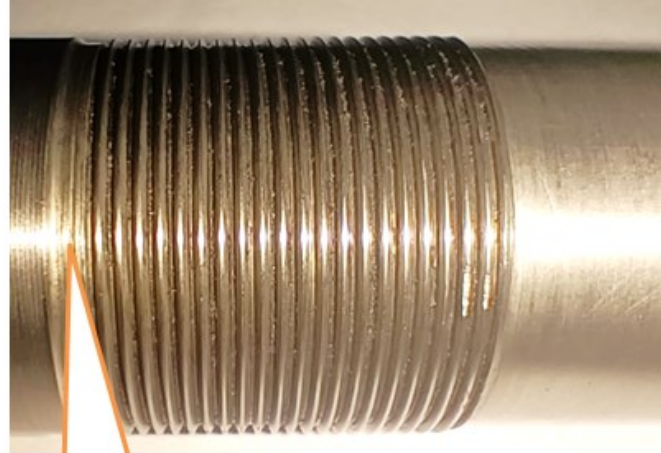
Thread minor diameter mark in the groove to answer the gauge till last